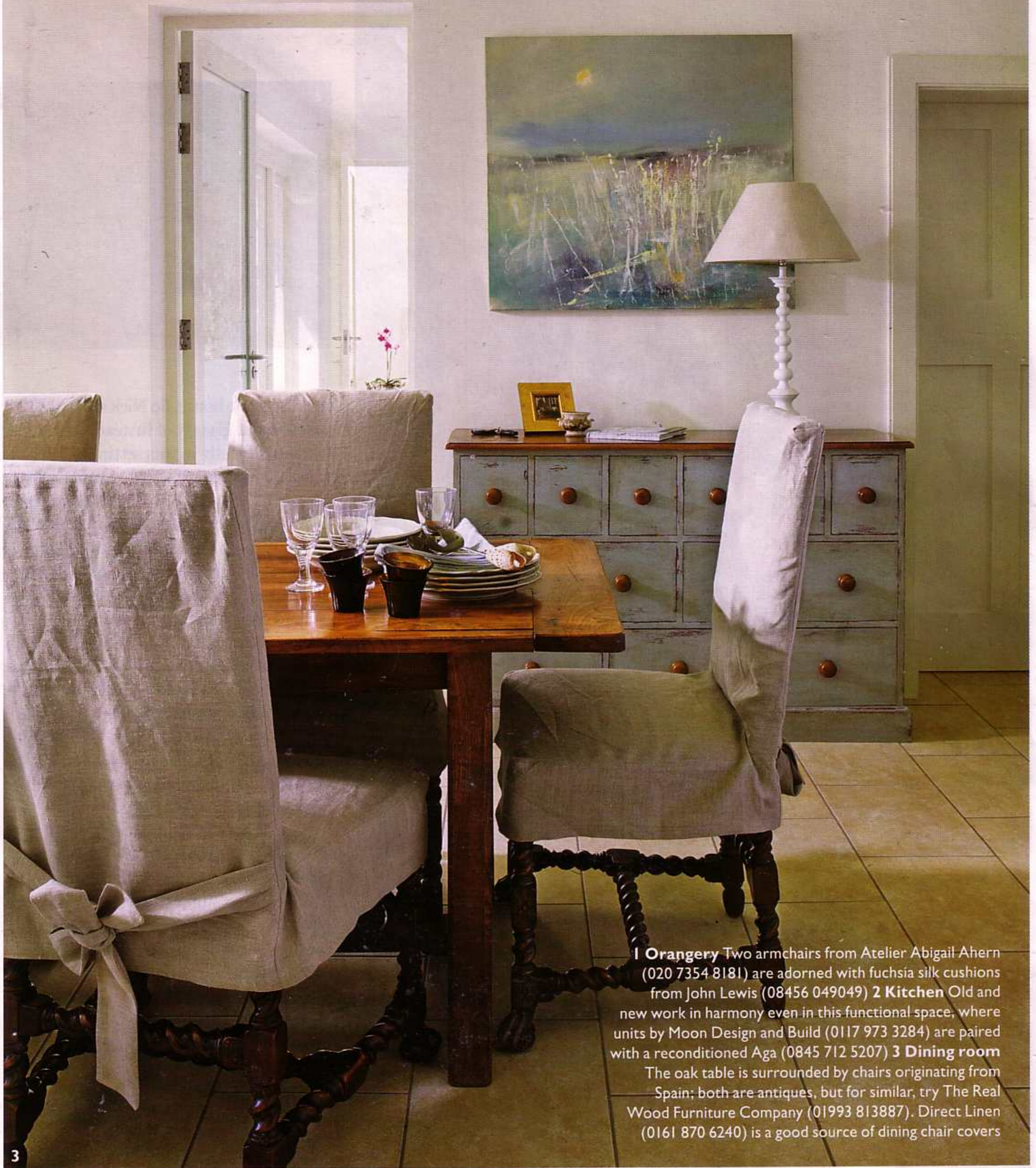
1 Orangery Two armchairs from Atelier Abigail Ahern (020 7354 8181) are adorned with fuchsia silk cushions from John Lewis (08456 049049) 2 Kitchen Old and new work in harmony even in this functional space, where units by Moon Design and Build (0117 973 3284) are paired with a reconditioned Aga (0845 712 5207) 3 Dining room The oak table is surrounded by chairs originating from Spain; both are antiques, but for similar, try The Real Wood Furniture Company (01993 813887). Direct Linen (0161 870 6240) is a good source of dining chair covers

my breath away. It had obviously been the previous owners' pride and joy,' she adds.